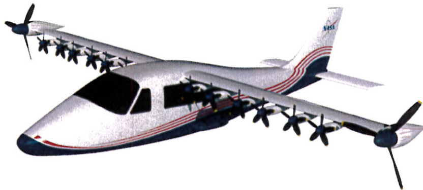
Figure 1: The Maxwell X-57 eVTOL aircraft currently under development at NASA.

In the last few years, the technology front has witnessed the increasing popularity of electric aircraft utilizing distributed propulsion, enabling electric vertical takeoff and landing, or eVTOL. The X-57 Maxwell, illustrated in Fig. 1, is an eVTOL concept currently under development at NASA. Such aircraft are being considered for use as air taxis, urban commuter aircraft, and personal transport. While single propeller-on-wing interactions have been modeled successfully, the emergence of eVTOL designs make it desirable to model multiple propeller-on-wing interactions for design optimization, as well as single propeller-on-wing interactions in more complex cases. This is due to the fact that distributed propulsion has an aerodynamic effect on lift that is not yet well understood at a fundamental level. Traditionally, aerodynamics have been modeled using computational fluid dynamics (CFD). However, the intense computational cost of CFD makes its use in design optimization impractical. It then becomes desirable to develop less computationally expensive models that can be used in optimization. With such a model, optimization algorithms could be utilized to quickly and effectively realize the dream of commercial-quality eVTOL aircraft.